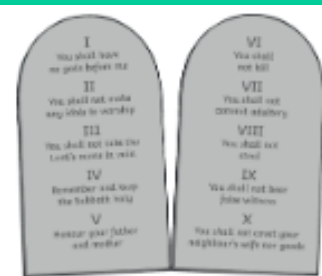
God gave Moses the 10 Commandments