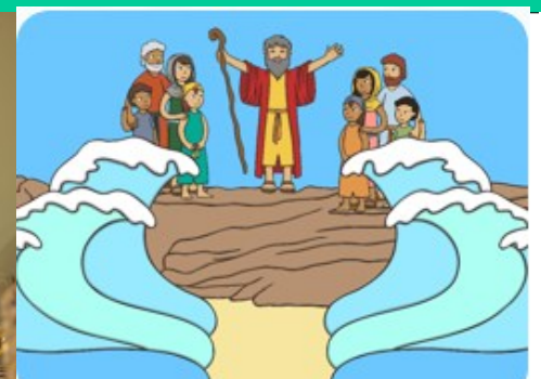
Moses led the Jewish people out of slavery in Egypt