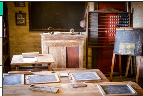
A Victorian school room looked very different to our modern classrooms today. Teachers and children wrote with chalk on slates and school punishments were very harsh.