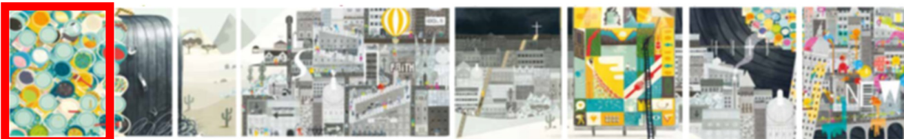
Creation The Fall